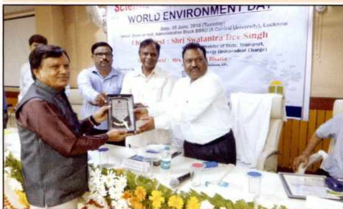
Eminent Scientist Award