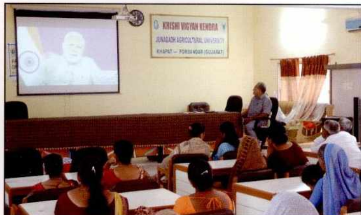
Live to webcast of interaction of Shri Narendra Modi, Hon'ble Pradhan Mantri, India with farmers at all KVKs of JAU, Junagadh on June 20, 2018