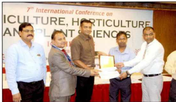
“Outstanding Scientist Award 2018”

Entomology, College of Agriculture, JAU, Junagadh was awarded “Outstanding Scientist Award 2018” in 7 th International Conference on Agriculture, Horticulture and Plant Science organized by “The Society of Tropical Agriculture” during June 28-29, 2018 at Shimla, H.P., India. He also awarded the “Certificate for Best Research Paper Presentation” during the same conference.