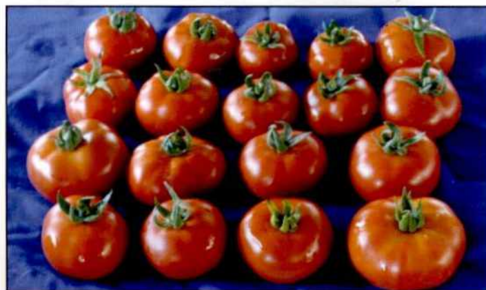
Gujarat Tomato 6 (GT 6)

Gujarat Tomato 6 is recommended for the farmers of Gujarat during the late Kharif-rabi season. The variety has recorded a mean fruit yield of 316.00 q/ha. The fruits are medium in size, flat round in shape with an attractive red colour and 3 to 4 locules with high T.S.S. It is found superior against leaf curl and fruit borer infestations compared to all the check varieties.