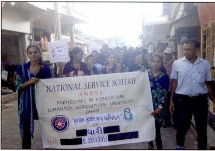
Volunteers of NSS, Polytechnic College, Dhari promoted the awareness amongst people of Dhari about the water saving on the eve of the launching of "Sujlam Suflam Jal Sanchay Abhiyan" by the Gujarat of Gujarat from May 1-30, 2018