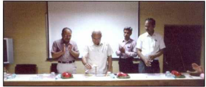
Training on "Qualitative production, value addition, and business approach for doubling farm income"

consisted of a host of lectures by scientists on water management, use of mulching in agriculture, farm production-market linkage management, the business approach in agriculture etc.