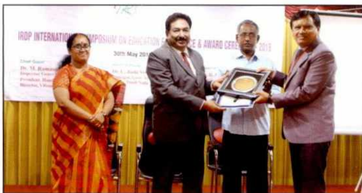
Dr A. P. J. Abdul Kalam Lifetime Achievement National Award