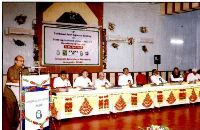
14 th Combined Joint AGRESCO Meeting of SAU's and Kamdhenu University