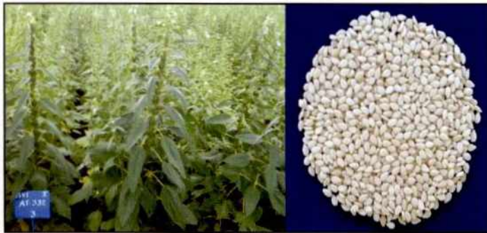
Gujarat Til 6 (GT 6)

Gujarat Til 6 is recommended for the farmers of Gujarat growing under rainfed condition. The variety has recorded the seed yield of 1010 kg/ha. The oil content is 49.68 %. The variety possessed white and bold seeds.