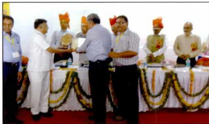
Lt. Amit Singh Memorial (LASM) Award 2017-18 conferred to Vegetable Research Station, J.A.U., Junagadh

the best AICRP (VC) Coordinating Center conferred to Vegetable Research Station, J.A.U., Junagadh on May 18, 2018.