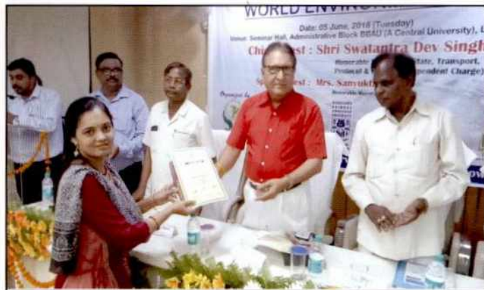
KVK Scientist Award