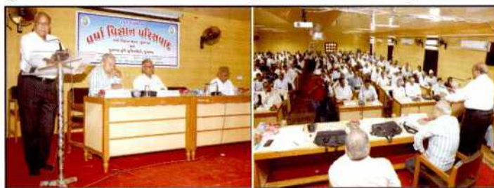
Varsha Vigyan Parisamvad