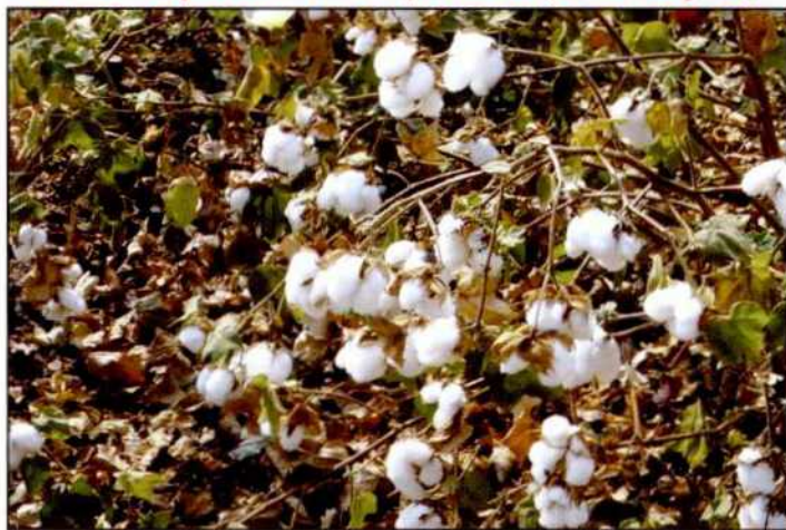
Gujarat Cotton Hybrid 22 (G. Cot. Hy 22)

Gujarat Cotton Hybrid-22 is a Non-Bt hybrid cotton recommended for irrigated condition in Gujarat state. The hybrid has recorded 2865 kg/ha mean seed cotton yield with 1010 kg/ha lint yield. It has 34.7 % ginning out-turn and 18.37 % oil content. The hybrid is medium late in maturity.