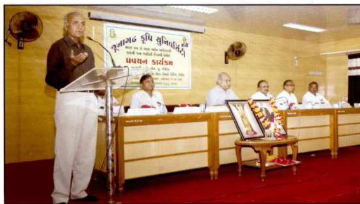
A celebration of Bharat Ratna Dr Babasaheb Ambedkar's 127 th Birth Anniversary