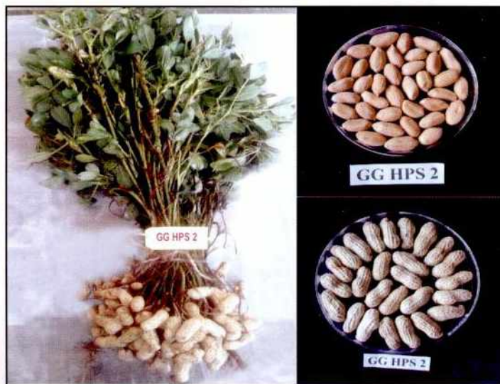
Gujarat Groundnut-HPS2 (GG HPS 2)

This is a large seeded confectionery type groundnut variety recommended for cultivation in Gujarat state during Kharif season. This variety has recorded a mean pod yield of 2835 kg/ha. It is resistance to tikka and rust diseases as compared to check varieties.