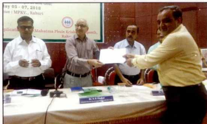
“Best Presentation Award”