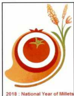
2018 - National Year of Millets

Though millets can be used as functional food substitutes in many of the food preparations of everyday Indian cuisine, most of the consumers (especially urban) are not aware of the great advantages that these items can provide and hence fail to use them properly. The Government of India has taken various measures to address this gap. The first and foremost measure is that of the Ministry of Agriculture and Farmers' Welfare which has declared millets as nutri-cereals, thereby, fulfilling the long-standing demand of the millet industry. Secondly, the Food Safety and Standards Authority of India (FSSAI) has issued draft notifications prescribing revised comprehensive standards for addressing the issues of quality and purity of millet products. Thirdly, and most importantly, the Central Government has accepted the recommendation of including millet products under Public Distribution System (PDS). Thereby, paving way to the increased scope both in terms of production and marketing of all the major millet crops in India such as sorghum (jowar), pearl millet (bajra), finger millet (ragi/mandua) and minor millets viz. foxtail millet (kangani/kakun), proso millet (cheena), kodo millet (kodo), barnyard millet (sawa/sanwa/jhangora), little millet (kutki) along with two pseudo millets (black-wheat (kuttu) and amaranthus (chaulai).