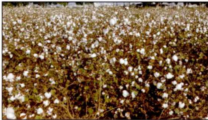
Gujarat Junagadh Cotton 102 (GJ. Cot 102)

Gujarat Junagadh Cotton-102 (GJ Cot 102) is Non-Bt cotton for growing in Gujarat state under irrigated condition. It has recorded a mean seed cotton yield of 2215 kg/ha. The lint yield in is 769 kg/ha with 35.1 % ginning out-turn and 18.32 % oil content. This variety is medium late in maturity.