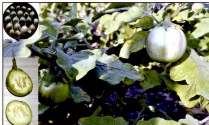
Gujarat Round Brinjal 5 (GRB 5)

and light green in colour with purple shadow strip and good in shining. GRB5 is found superior against insect-pests and disease resistance.