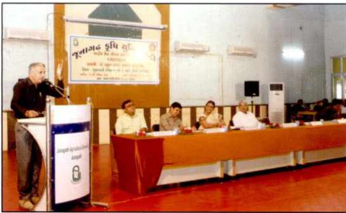
A Special lecture on "History of Junagadh and prevailing Situation of Agriculture."