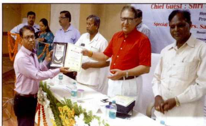
Excellence in Research-2017 Award