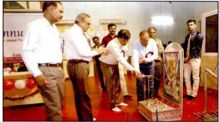
Inaugural of Frennuwell 2018 at College of Agricultural Engineering and Technology, JAU, Junagadh on April 17, 2018