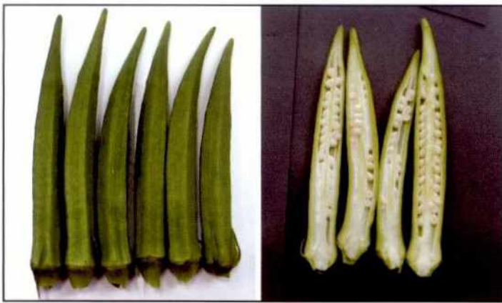
Gujarat Okra 6 (GO 6)