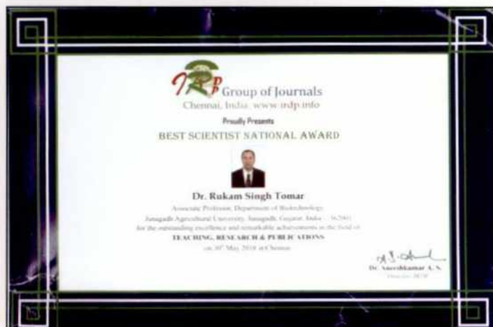
“Best Scientist National Award” and “Young Scientist – 2018” National Award