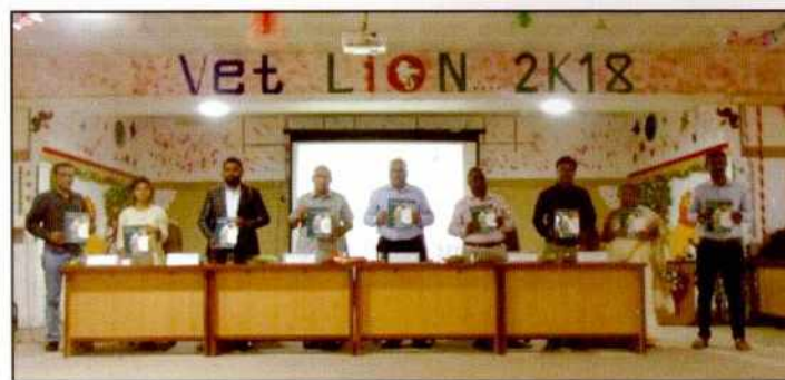
The release of Annual Report of College of Veterinary Sci. & A.H., JAU, Junagadh on the occasion of World Veterinary Day 2018 Celebration