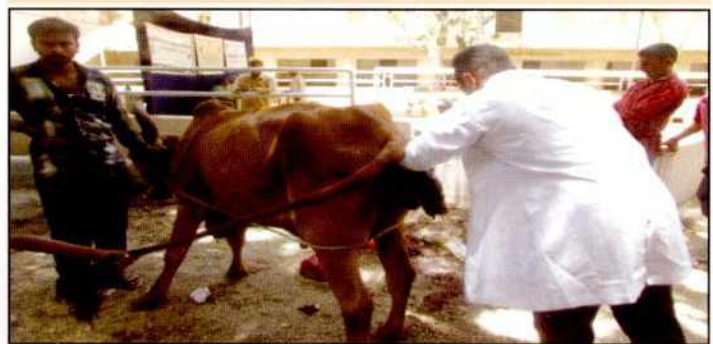
A special Veterinary Clinical Camp sponsored by Saurashtra Pranikalyan Trust, which was organized by Bhanvad Mahajan Panjarapol Gaushala, Bhanvad in collaboration with CoVS&AH, JAU, Junagadh and Animal Husbandry Department, Devbhumi Dwarka on May 5, 2018, at Bhanvad